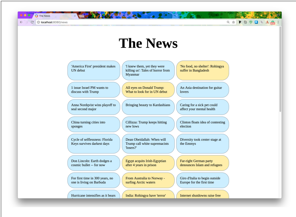
Figure 4-1. The final product of our news scraper: headlines from CNN are shown in one color, and Al Jazeera in another

Web scraping has become quite difficult nowadays. For example, if you try requests.get('http://edition.cnn.com') , you're going to find that the response contains very little usable data! It has become increasingly necessary to be able to execute JavaScript locally in order to obtain data, because many sites use JavaScript to load their actual content. The process of executing such JavaScript to produce the final, complete HTML output is called rendering .